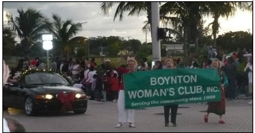
BWC participated in the annual Boynton Beach Parade.

● Seminars: I attended a Chamber Seminar at the Children' Services Council regarding Grant writing. There is a relatively new website with information on the county that can help with statistics in grant writing and give other information that you might find perti-