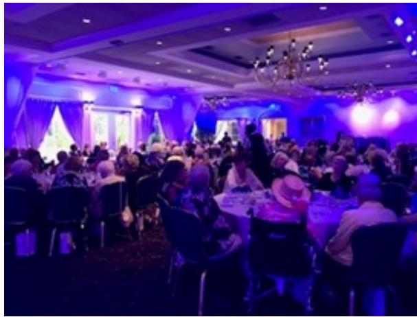
Bathed in Blue