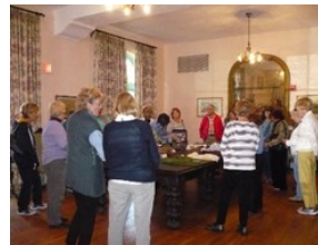
Describing the judging process