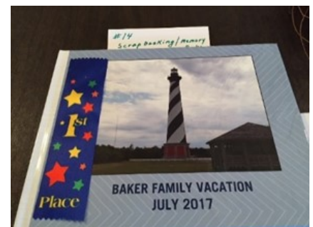
Kay Baker Scrapbooking/Digital