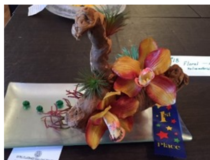
Kay Baker, Floral/No Live material